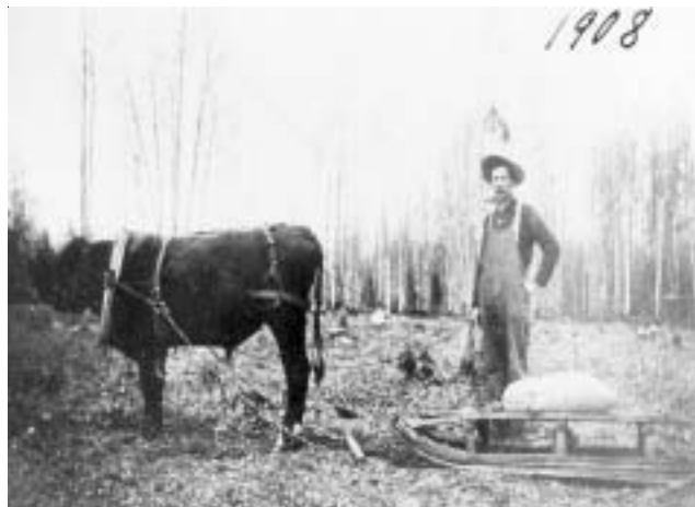
Finnish American Cultural Activities