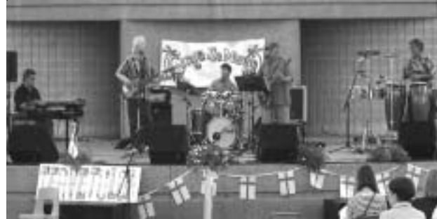
Upper Michigan’s Conga Se Menne gets their reggae on at Finn Grand Fest in Sault Ste. Marie.

customs line, and then took only a few short stops along the route. We had quite a lightning show over Duluth, before reaching Esko just before midnight. All in all we had a very enjoyable trip to the Finn Grand Fest and look forward to attending another.